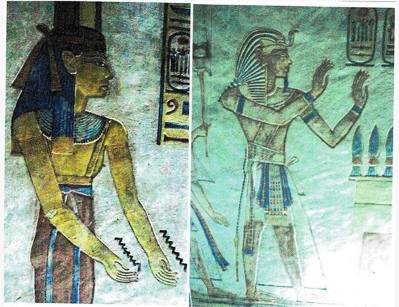
Goddess & Pharaoh with right & left hands

The image of the goddess from a tomb in the Valley of the Queens has two left hands and jagged lines are shown above her outstretched arms and hands. The conventional translation of this hieroglyphic symbol is "water." Sometimes this symbol has a single jagged line, sometimes two