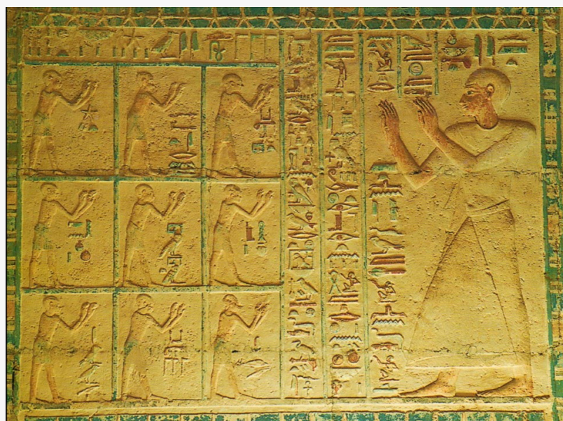
Hands from Tomb of Petosiris at Tuna El-Gebel dated to 300 BCE

-- When traditional Egyptology began interpreting ancient Egyptian art and symbols, electricity had not been discovered. Therefore, with modern eyes we can interpret symbols in light of what is now known. Among the archeological legacies of past world cultures many images of hands and eyes were stenciled on cave walls, painted in tombs, or etched onto artifacts. The significance of human hands seems to be a universal and enduring theme. Examples include Ancestral Pueblo pictographs from Chaco Canyon, the "rattlesnake disk" from the Moundville site in Oklahoma, and Craig Mound at the Spiro site also in Oklahoma. A hand with an eye in the center of the palm is also a common symbol of protection throughout the Middle East. What author and researcher James Brown calls the "power position," raised hands with palms out, appears frequently in Egyptian art and