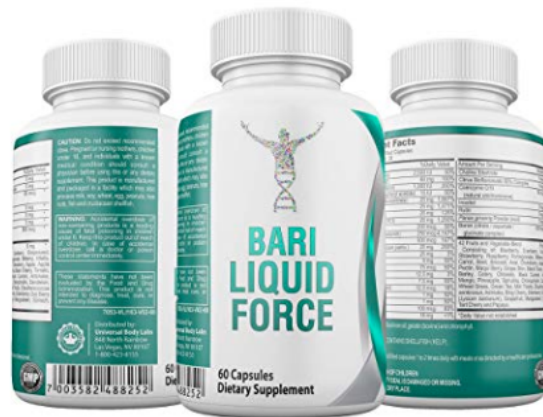
Bariatric Liquid Force Multivitamin