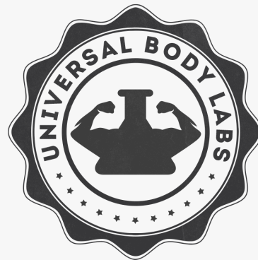
Universal Body Labs

“My levels were not good at my follow up appointment, and the doc got on me about taking my