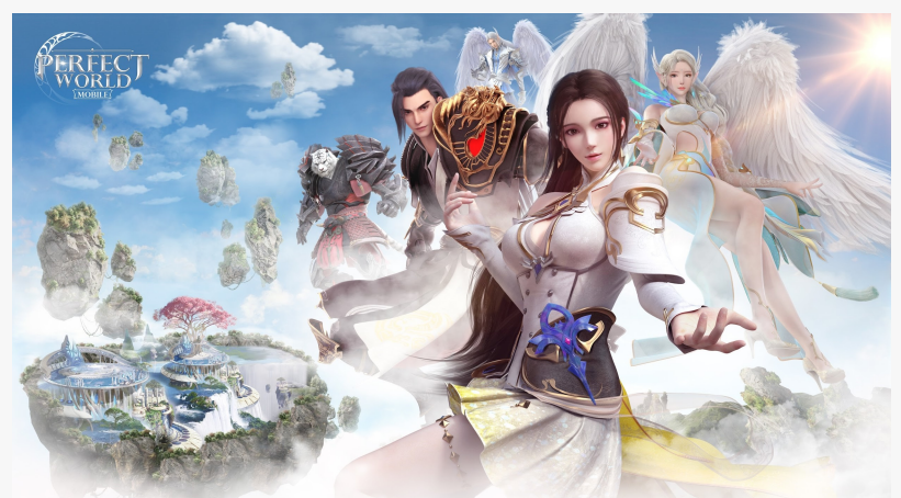
NA out now