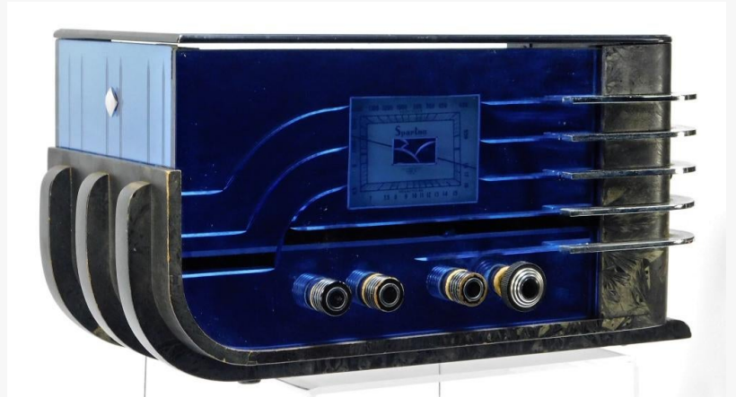
Walter Dornin Teague (American, 1883-1960) for Sparton model 557 sled radio, made in the Art Deco style, with cobalt blue mirrors on the front, top and left side (est. $2,000-$3,000).

This press release can be viewed online at: http://www.einpresswire.com