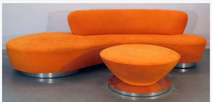
Sofa and ottoman set by Vladimir Kagan (German-American, 1927-2016), with an orange biomorphic serpentine sofa on aluminum feet and a round, tapered ottoman (est. $6,000-$9,000).

CRANSTON, RI, UNITED STATES, September 5, 2019 /EINPresswire.com/ -- An eclectic Mid-Century Modern auction featuring quality items pulled from estates across New England – including art glass, lighting, figures, bronzes, furniture by several designers and much more – is planned for Saturday, September 14th, by Bruneau & Co. Auctioneers, online and in the firm's Cranston gallery at 63 Fourth Avenue, at 12 noon Eastern.