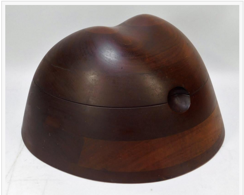
Carved wood jewelry or storage box with a curvaceous biomorphic lid by Wendell Castle (Kan./N.Y., 1932-2018), incised "WC" and dated "72" on the right side (est. $2,500-$4,000).