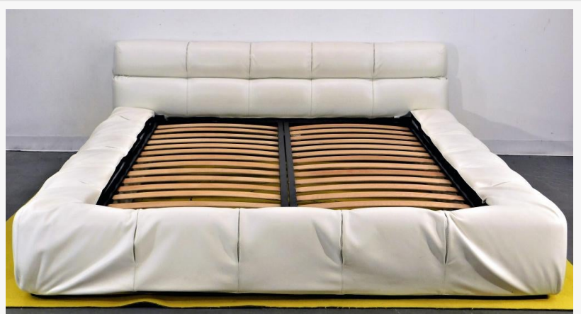
B and B Italia Maxalto white tufted bed by Patricia Urquiola (Italy, 2008) with tufted rectangular headrest over matching tufted side rails, 96 inches deep by 80 inches wide (est. $3,000-$5,000).

Travis Landry Bruneau & Co. Auctioneers +1 401-533-9980 email us here