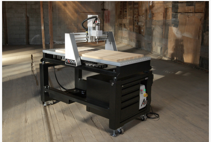
Axiom Precision AR8 Pro+ is among Axiom's most popular CNC routers and features a 2x4 foot working surface.

This press release can be viewed online at: http://www.einpresswire.com