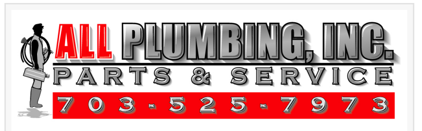
All Plumbing has been providing excellent customer service since 1970.

ARLINGTON, VIRGINIA, UNITED STATES, September 6, 2019 /EINPresswire.com/ -- <u>All Plumbing</u>, Inc. has just brought home the prestigious <u>Pulse of the City</u> <u>News</u> Customer Satisfaction Award for the eighth consecutive year by earning the highest possible customer satisfaction rating of 5 stars.