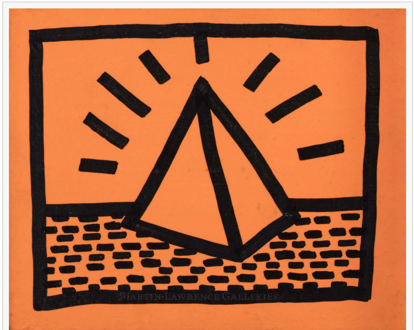
Keith Haring Untitled, 1982 (May 17, 1982 Pyramid) 1982 fluorescent paint and black marker on wood image size/ 6.8 x 8.8

Katia Graytok Chalk & Vermilion Fine Art email us here +1 203-989-2073