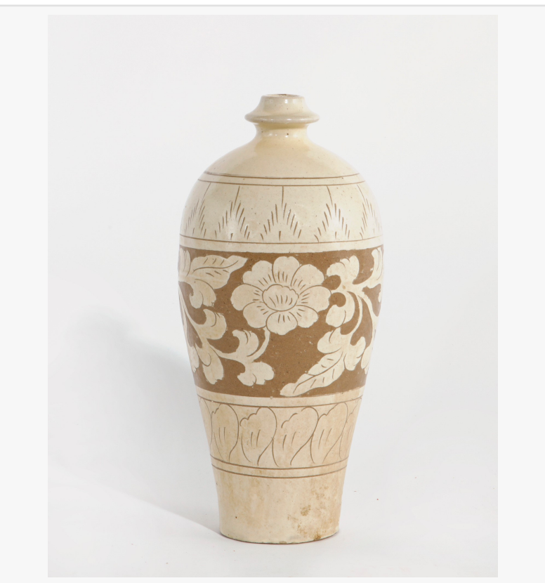
Chinese ceramic carved Cizhou style meiping vase from the Song dynasty (est. $8,000-$12,000).

The estate of Richard E. Faggioli from Northern California is a wonderful example of historic collecting, with 18th and 19th century furniture, porcelain, paintings and accessories. A lovely convertible Regency mahogany writing desk with lacquer firescreen (est. $400-$600) is a gem. A pair of English watercolors of bucolic scenes