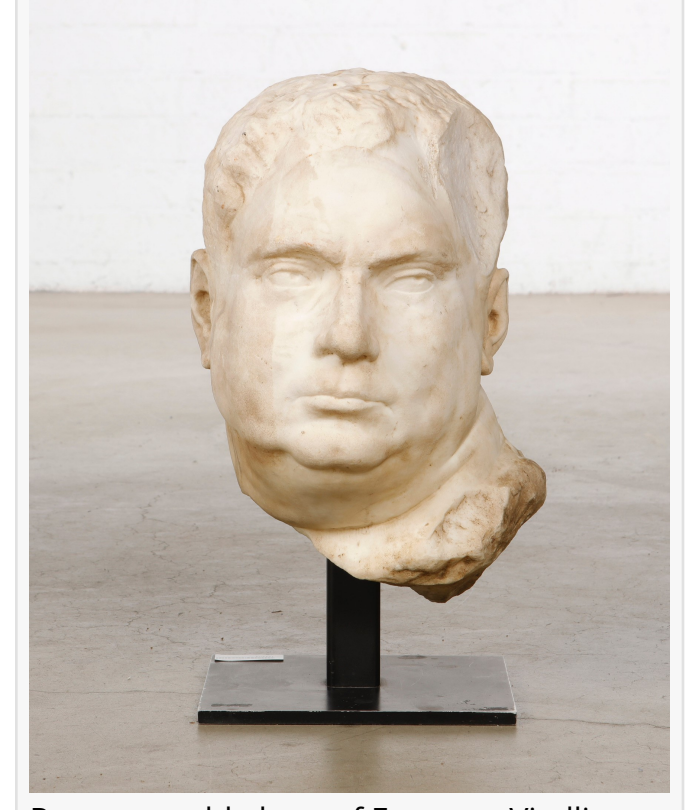
Roman marble bust of Emperor Vitellius after the Grimani Vitellius, with an overall height of 19 inches (est. $15,000-$20,000).