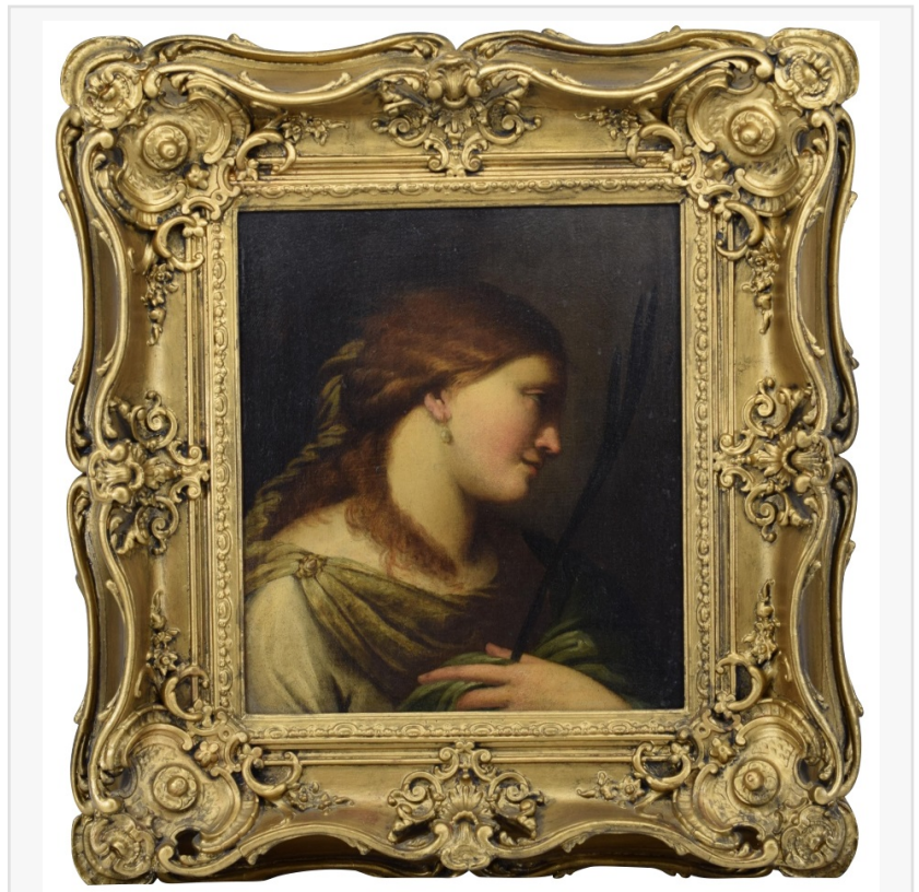
Oil on canvas portrait painting attributed to the Ludovico Carracci (Italian, 1555-1619), a female portrait to the neck with a twig in one hand, 17 ¼ inches by 14 ¾ inches (est. $7,500-$12,500).