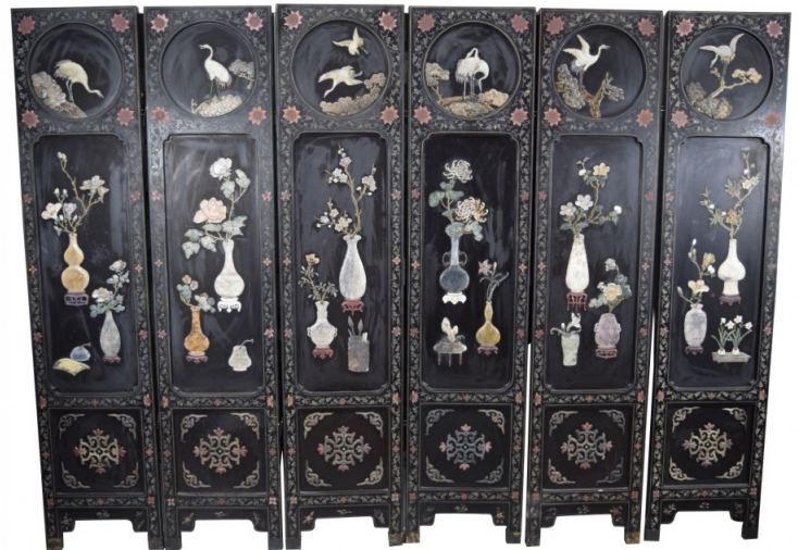
Chinese six-panel wood screen boasting stonework of various semi-precious stones to include lapis, rose quartz and jade; each panel has an inlaid floral scrollwork motif (est. $1,000-$10,000).