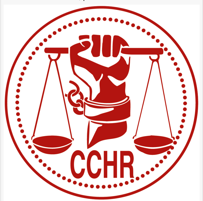
The Florida chapter of CCHR is a non-profit mental health watchdog dedicated to the protection of children.

"With no clinical trials proving its safety, electroshock treatment plays Russian roulette with the lives of vulnerable people who are often ill-informed about its long-term effects, including, according to an ECT device manufacturer, permanent brain dama