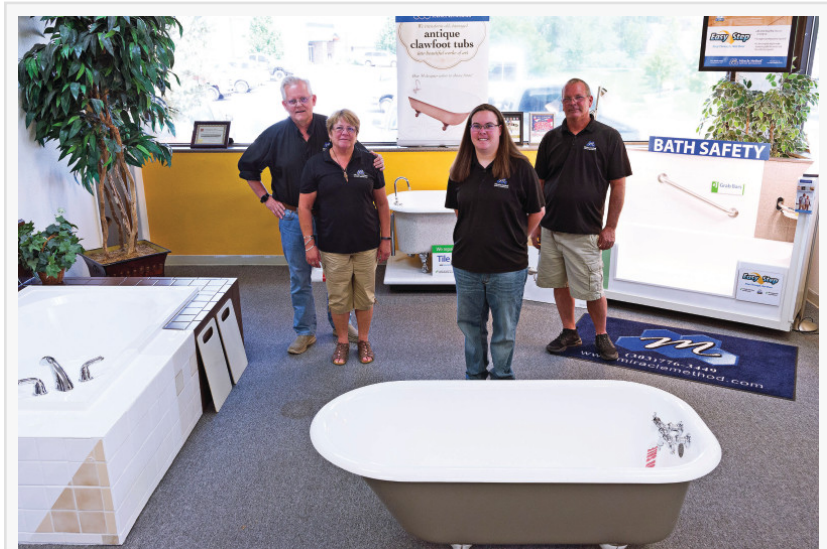
Miracle Method has been saving customers money and reinvigorating worn baths and kitchens since 2002.

puddle in the tub, a chip in a bathtub caused by falling tile or tools during new construction, or an older home being renovated, contractors seek out Miracle Method. "I have used Miracle