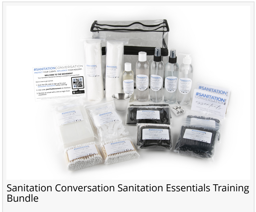
Sanitation Conversation Sanitation Essentials Training Bundle

After successful completion of the Sanitation Standards training, the artist is provided with a Certificate of Completion, a Prestige Pin and is added to the online Sanitation Specialist database where hiring managers, union heads, and clients can confirm the artist has been properly trained in sanitation. The certificate and pin is symbolic of the artist's sanitation training, distinguishing them from other artists. It also demonstrates their advocacy for improved sanitation standards in the makeup industry.