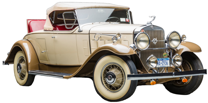
1931 Cadillac 335 Fleetwood, tan/cream rumble seat roadster with red leather interior, V-8 motor and goddess radiator ornament, restored in 1971-72 (est. $80,00-$120,000).

Automobiles from the estate of Lisle Hopkins in Bath, New York include a 1931 Packard Model 840 and a 1931 Cadillac 335 Fleetwood, both with estimates of $80,000-$120,000. From the Peter Tillou collection is a 1927 Hudson Super Six Sports Tourer, constructed in the early 1990's in Australia by builder and master craftsman Wolfgang Rebien. Every aspect of the car is inspired by the factory racing Hudsons of its day and the finest coachbuilding traditions of the 1930s. The car is expected to speed off for $120,000-$160,000. Modern paintings and sculptures include a screenprint by Andy Warhol (American, 1928-1987), titled Vegetarian Vegetable, from Campbell's Soup II (est. $15,000-$25,000); a modern sculpture by Dame Elisabeth Frink , R.A. (British, 1930-1993), titled Birdman IV (est. $15,000-$25,000); and