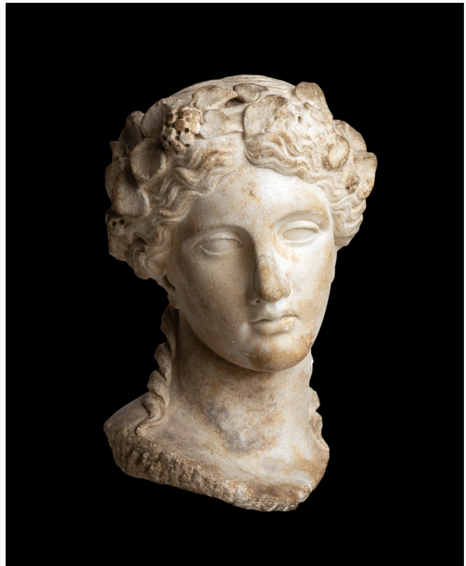
Life-size Roman marble head of Dionysos, after an early 4th century BC late Classical Greek archetype, dating to the Roman Imperial, Hadrianic period (est. $50,000-$80,000).