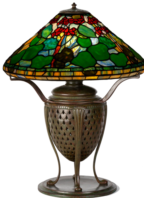
Tiffany Studios (N.Y.) "Geranium" table lamp, leaded glass and patinated bronze, 17-inch shade impressed TIFFANY STUDIOS NY, 20 ½ inches tall (est. $60,000-$80,000).

Notable items from the Lorraine and Sy Merrall Collection include the iconic Danish designed "Papa Bear" and "Chieftain" chairs by Hans Wegner and Finn Juhl (both est. $3,000-$5,000).