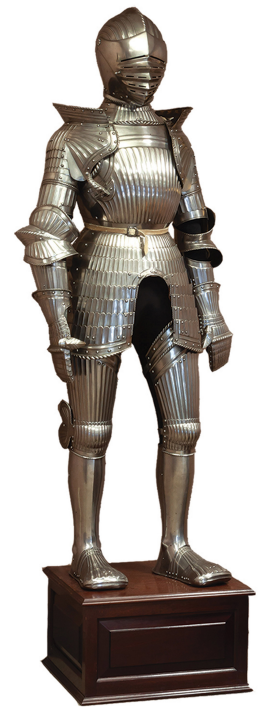
Maximillian suit of armor, 16th century style, exceptional quality, Peter Finer (London), from the Peter Tillou collection (est. $35,000-$55,000).

Matt Cottone Cottone Auctions +1 585-243-1000 email us here