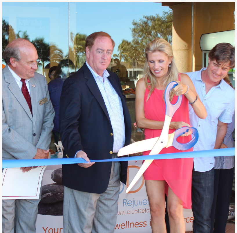
Grand Opening Ribbon Cutting for Club Detox with members of the Chamber of Commerce and City Officials from Newport Beach.