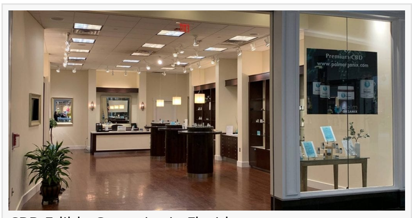
CBD Edible Gummies in Florida

WEST NYACK, NEW YORK, UNITED STATES, September 10, 2019 /EINPresswire.com/ -- West Nyack, New York: <u>Palm Organix™</u>, a leader in the sale of premium, broad spectrum CBD products today announced the launch of their latest product line, a Zero THC CBD 10mg gummy in <u>Florida</u>.