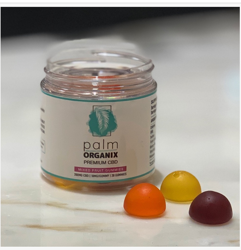
CBD Gummies in Florida