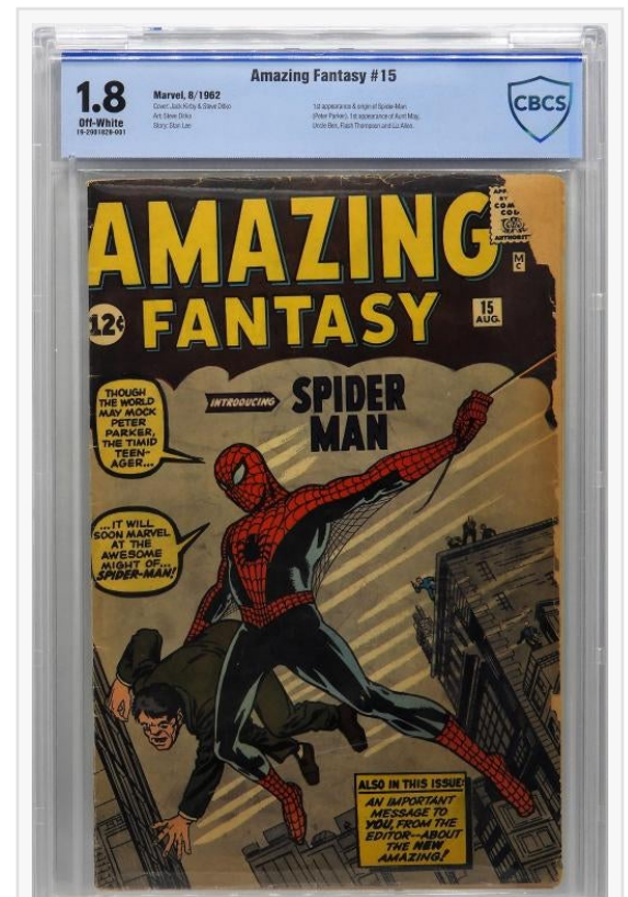
Copy of Marvel Comics Amazing Fantasy #15 (Aug. 1962), graded CBCS 1.8, featuring the first appearance and origin of Spider-Man as well as other primary characters (est. $7,000-$10,000).