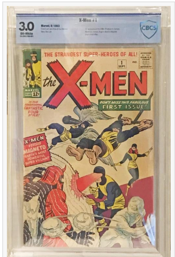
Copy of Marvel Comics X-Men #1 (Sept. 1963), graded CBCS 3.0, featuring the first appearance and origin of the X-Men, including Cyclops, Marvel Girl, Beast and others (est. $3,000-$4,000).

Travis Landry Bruneau & Co. Auctioneers +1 401-533-9980 email us here