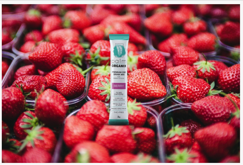
CBD Energy in Vermont

Palm Organix<sup>™</sup> Flagship store is a great resource to the community as our CBD specialists have the ability to educate our customers in person on the benefits of CBD oil and also allow them