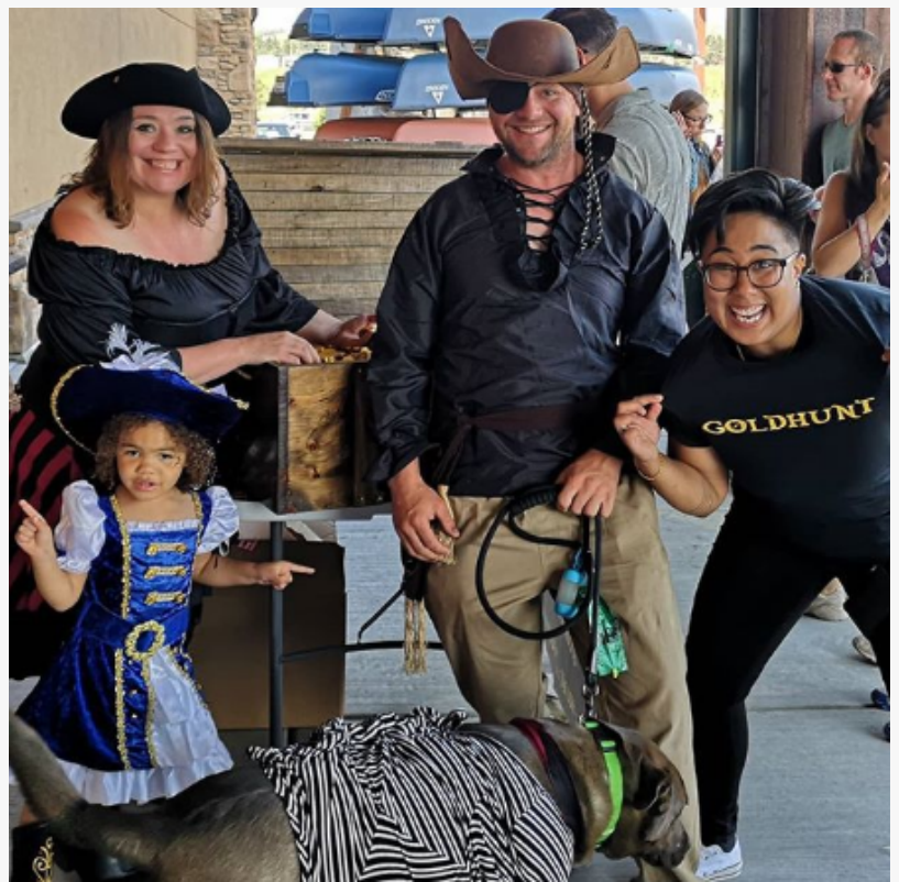
GoldHunt Family Participates in the GoldHunt - Animals Welcome, Too!