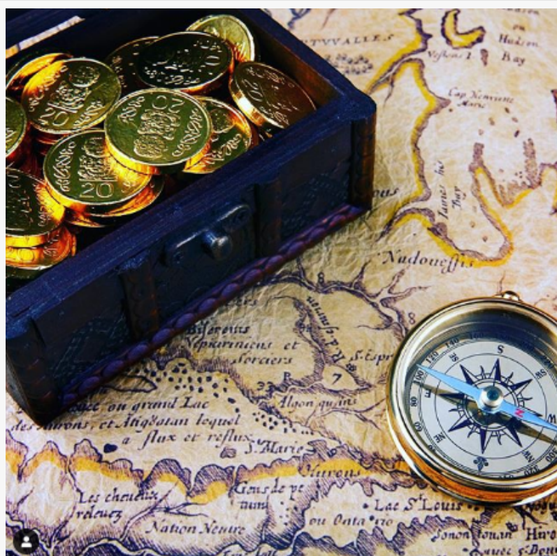
Redeem Real Life Treasure of $100,000 with the GoldHunt Adventure Treasure Hunt

GoldHunt will put your wits to the test as you roam around the city, learning about its history, finding unique and special places, while getting closer to the treasure!