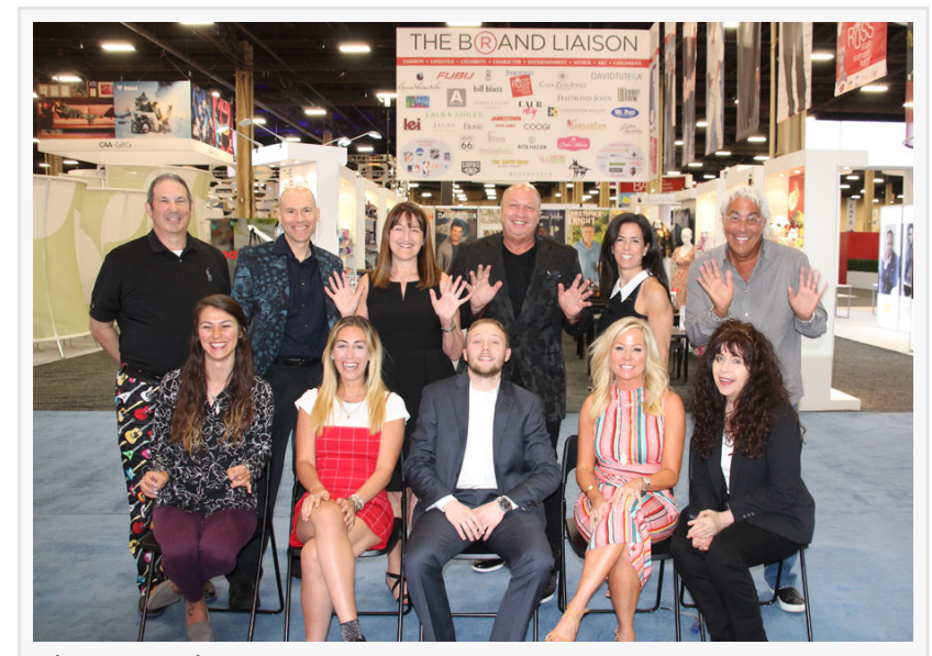
The Brand Liaison Team

For more details please log in more www.rapidretailmastermind.com, space is filling fast and food/drink will be available at the event. The events