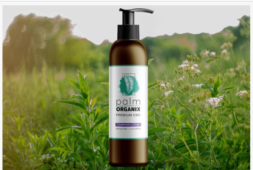
CBD Lotion For Pain in New York