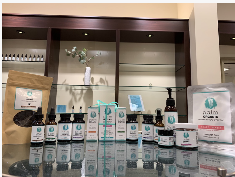
CBD Lotion Near Me in New York