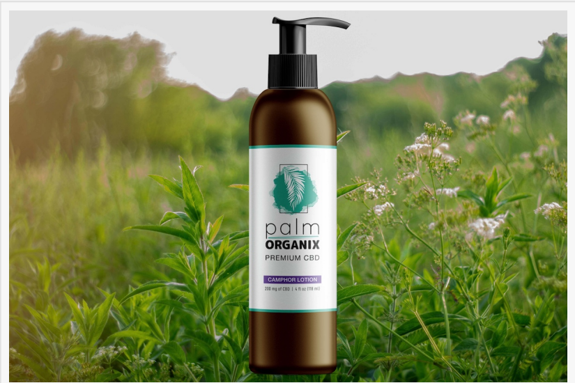
CBD Lotion For Pain in Pennsylvania