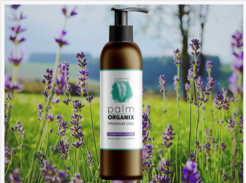
CBD Lotion For Back Pain in Pennsylvania

Gummies: Our CBD gummies come in different mixed fruit flavors and pack 10mg of CBD oil per