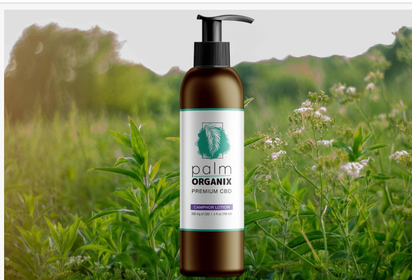
CBD Lotion For Pain in Texas