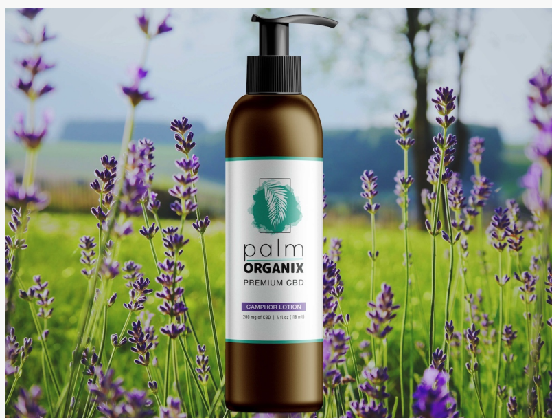
CBD Lotion For Back Pain in Texas

Gummies: Our CBD gummies come in different mixed fruit flavors and pack 10mg of CBD oil per