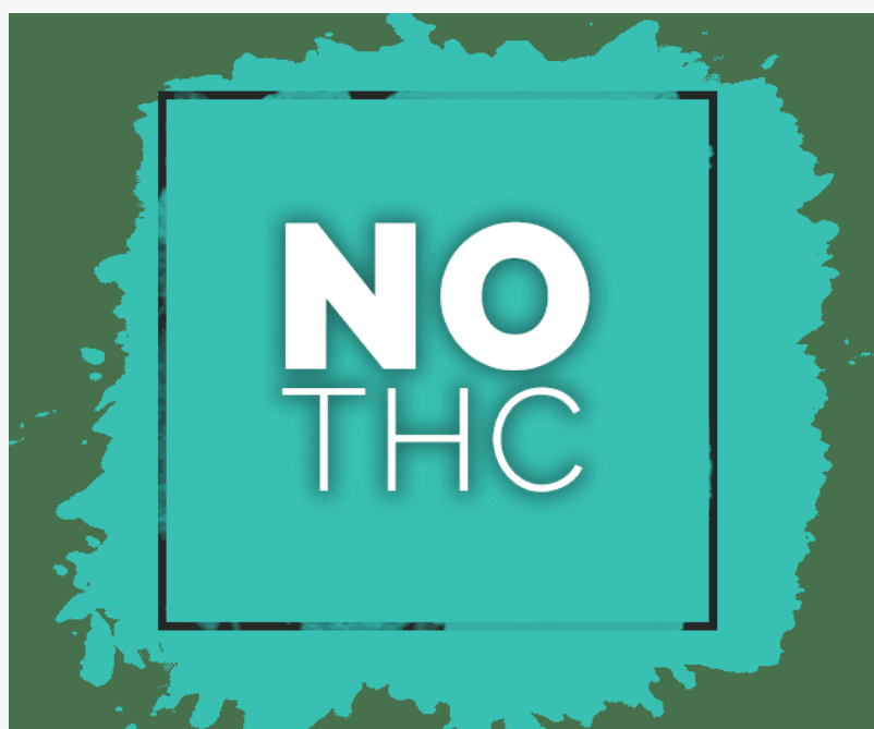
CBD Lotion For Sale in Texas