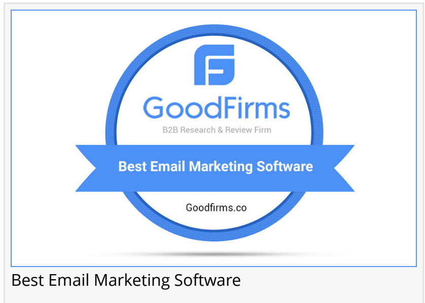
Best Email Marketing Software

WASHINGTON DC, WASHINGTON, UNITED STATES, September 12, 2019 /EINPresswire.com/ -- All size of businesses is immensely investing time and money in email marketing. Emails are playing a vital role as a mode of communication between businesses and potential customers. But, the companies are finding a dilemma to manage several emails and to send it to the clients on different timings. GoodFirms to help out the businesses with this issue has spotlighted the Best Email Marketing Software providers that are indexed with genuine ratings and reviews.