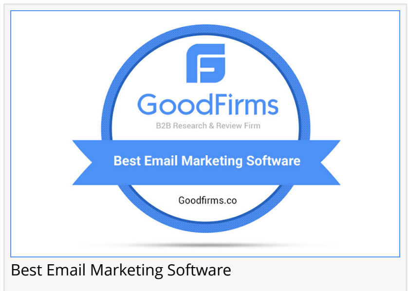
Best Email Marketing Software

WASHINGTON DC, WASHINGTON, UNITED STATES, September 12, 2019 /EINPresswire.com/ -- All size of businesses is immensely investing time and money in email marketing. Emails are playing a vital role as a mode of communication between businesses and potential customers. But, the companies are finding a dilemma to manage several emails and to send it to the clients on different timings. GoodFirms to help out the businesses with this issue has spotlighted the Best Email Marketing Software providers that are indexed with genuine ratings and reviews.