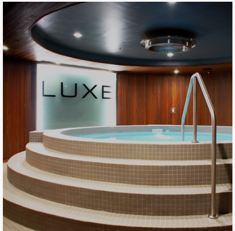
Luxe London Waterloo, Ontario

Each modern suite is fully upgraded and designed with the future resident in mind. Each suite is move-in ready with the highest quality luxuries. Luxe London suites are spacious with large expansive windows, stainless steel kitchen appliances, granite countertops with backsplash, glass showers, and more.