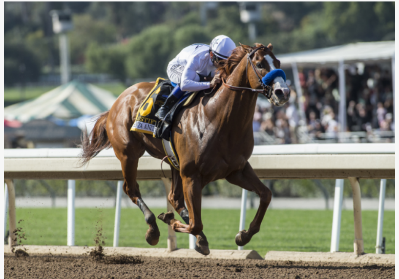
Justify wins the 2018 Santa Anita Derby