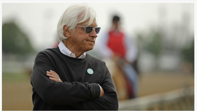
Trainer Bob Baffert

"Drug testing should be conducted and overseen by impartial operators and not by industry players with a vested interest in looking the other way. The Horseracing Integrity Act would put the independent U.S. Anti-Doping Agency (USADA) in the saddle and allow it to clean up a sport addicted to doping that's caused countless horse deaths.