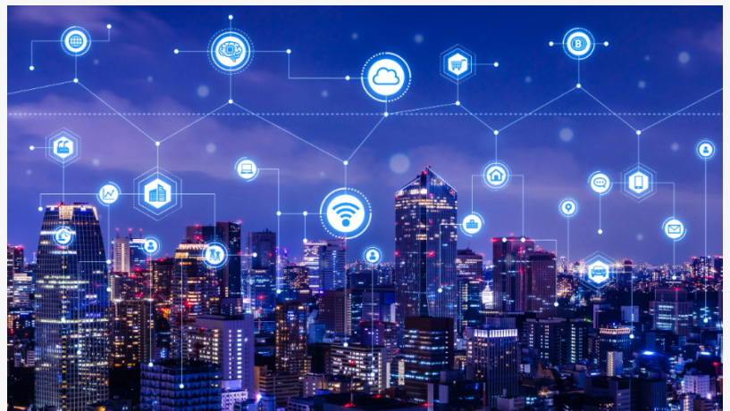
Paradigm Interactions Market Entry and Capability Building

Around this time we were courted by Accenture, PwC and KPMG, EY were not really involved in digital at this time. Each had their own rationale for what they wanted and why, but also they saw UX as a production skill not a strategic one. While there was a massive influx of graphic design into the field at that time, most of the