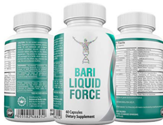
Bariatric Liquid Force Multivitamin

This press release can be viewed online at: http://www.einpresswire.com