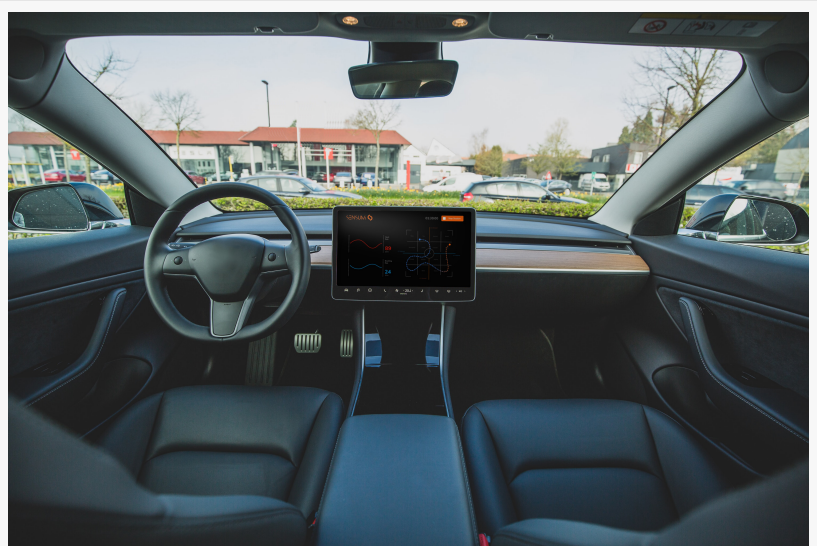
Synsis™ Empathic Technology Developer Kit

BELFAST, IRELAND, September 13, 2019 /EINPresswire.com/ -- Sensum, the empathic technology company, today launches the Synsis™ Empathic Technology Developer Kit , the world's first sensor-fusion kit for measuring real-time human states from body, face and voice data combined. Synsis equips automotive OEMs, tier one suppliers and simulator companies with a single solution to research and rapidly prototype a new generation of personalised in-cabin solutions. After several years of engineering custom solutions for the automotive industry