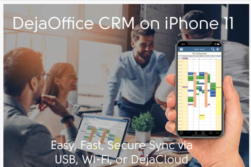
DejaOffice CRM App with PC Sync for iPhone 11

DejaOffice PC CRM Pro has a multi-user configuration that is much less expensive than Cloud based competitors.