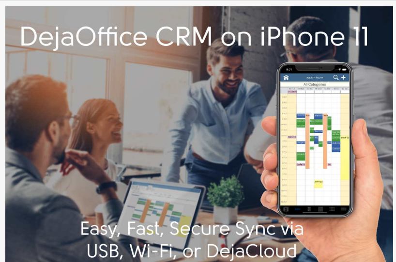
DejaOffice CRM App with PC Sync for iPhone 11

DejaOffice PC CRM Pro has a multi-user configuration that is much less expensive than Cloud based competitors.