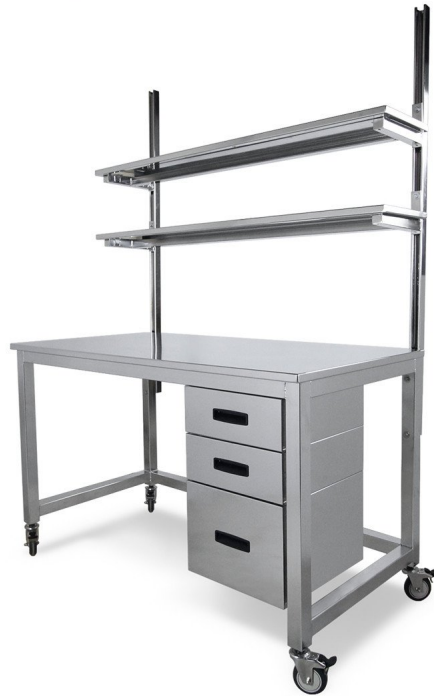
Stainless Steel Benchmarx