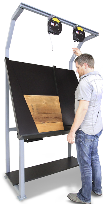
Custom setup that allows operators at a company building wooden planter boxes to organize their raw materials so they can work safely and efficiently.