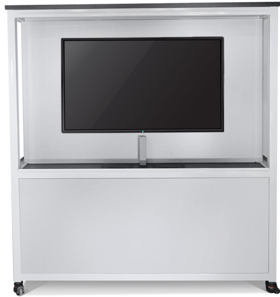
Custom bench with mounted tv

While preventing falls is a major concern in the construction industry, it's not the only one.