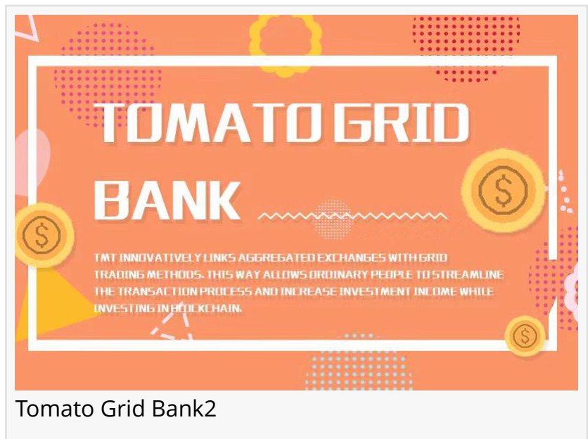
Tomato Grid Bank2

App of Tomato Grid Bank is seamlessly connected with the PC version. At present, the client supports multi-currency currency transactions.