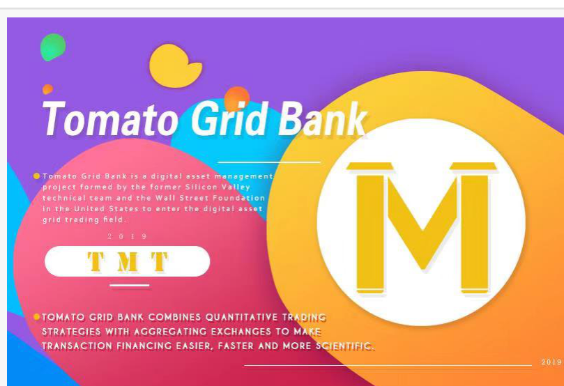
Tomato Grid Bank

With the participation of more users, Tomato Grid Bank is expected to become an important