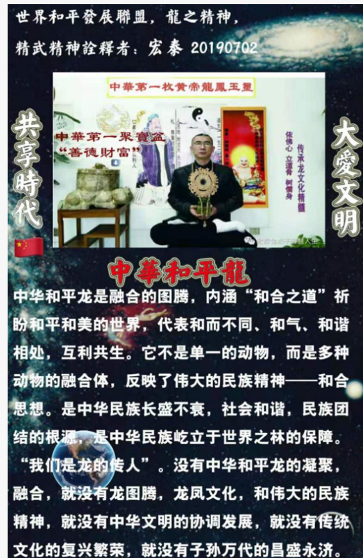
world peace development league-2