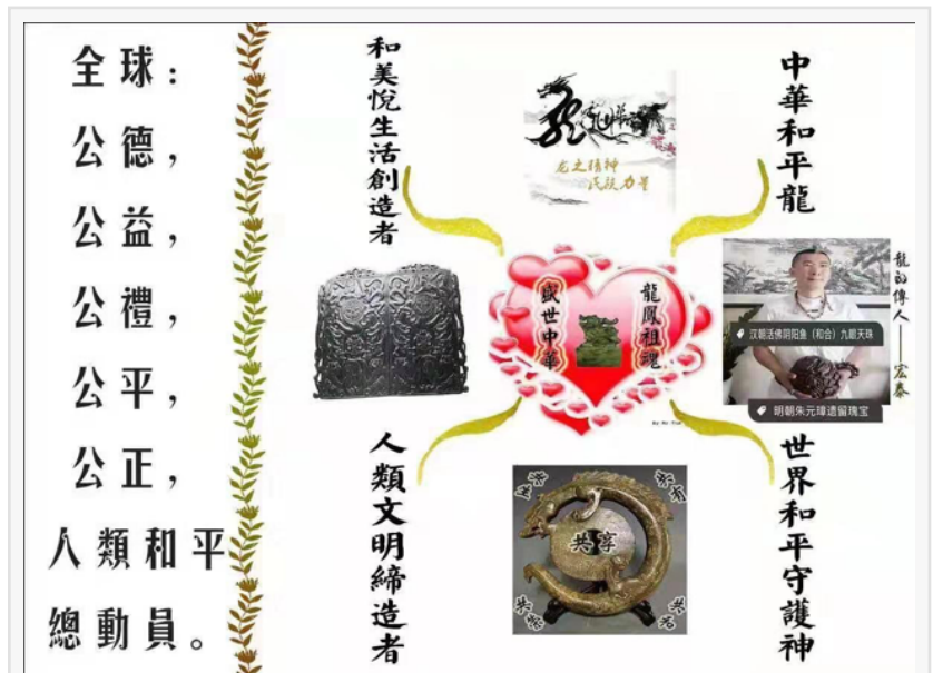
world peace development league-1

How much do humans desire peace? Perhaps just like darkness chasing the moment of daybreak