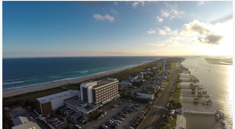
NC Surf to Sound Challenge elite course