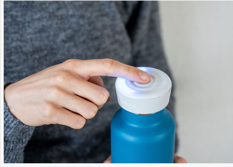
The Thrivve hydration bottle comes with a smart lid connected to the Thrivve app, with an intuitive light ring that helps form healthy habits.

Be one of the first to get your hands on this life-changing Thrivve bottle, get up to 25% and receive exclusive hydration tips and behind the scenes updates. For more information, please visit <a href="https://www.thrivve.co">www.thrivve.co</a>