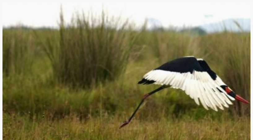
Mambamba Swamp Saddle Bill Stork