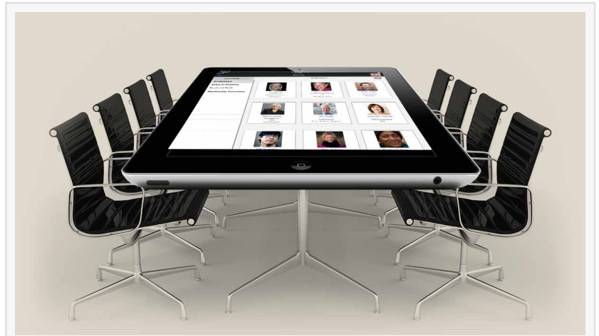
BoardBookit Board Portal Software

Press Relations BoardBookit +14125551212 email us here Visit us on social media: Facebook Twitter LinkedIn