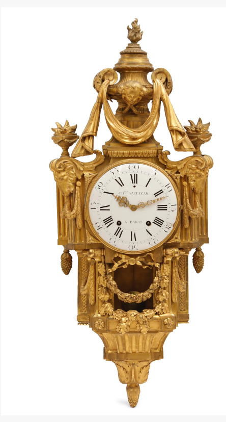
Late 18th century Louis XVI gilt bronze cartel clock by Charles Baltazar, 43 ½ inches tall by 18 inches wide (est. $4,000-$6,000).