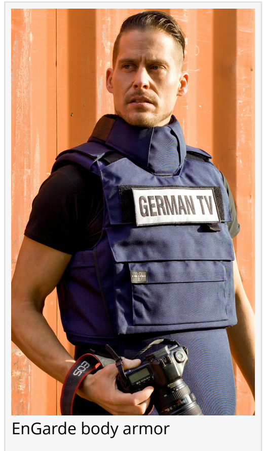
EnGarde body armor

This press release can be viewed online at: http://www.einpresswire.com