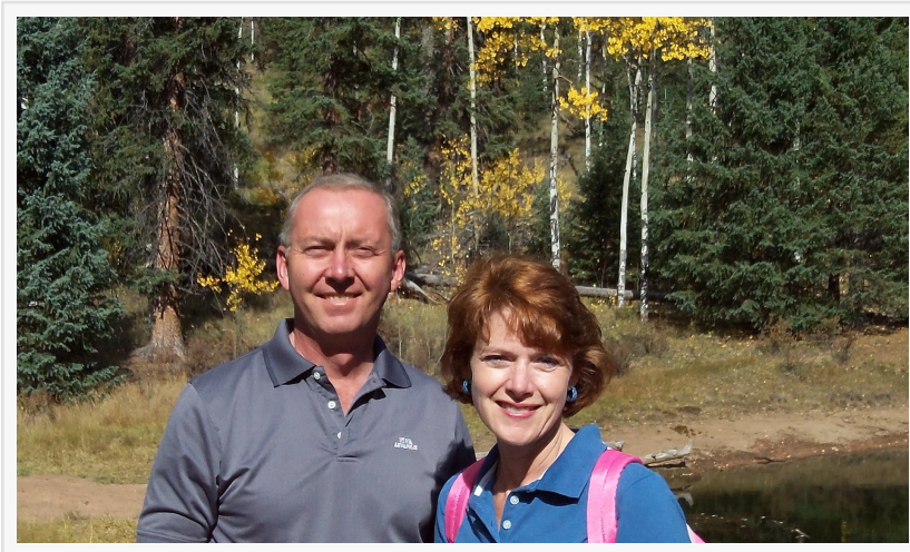
A hike in the Pikes Peak region is the perfect afternoon leaf peeping experience

Holden House1902 Bed & Breakfast Inn caters to couples and single travelers, featuring all suites with private bath, sitting area, fireplace, one