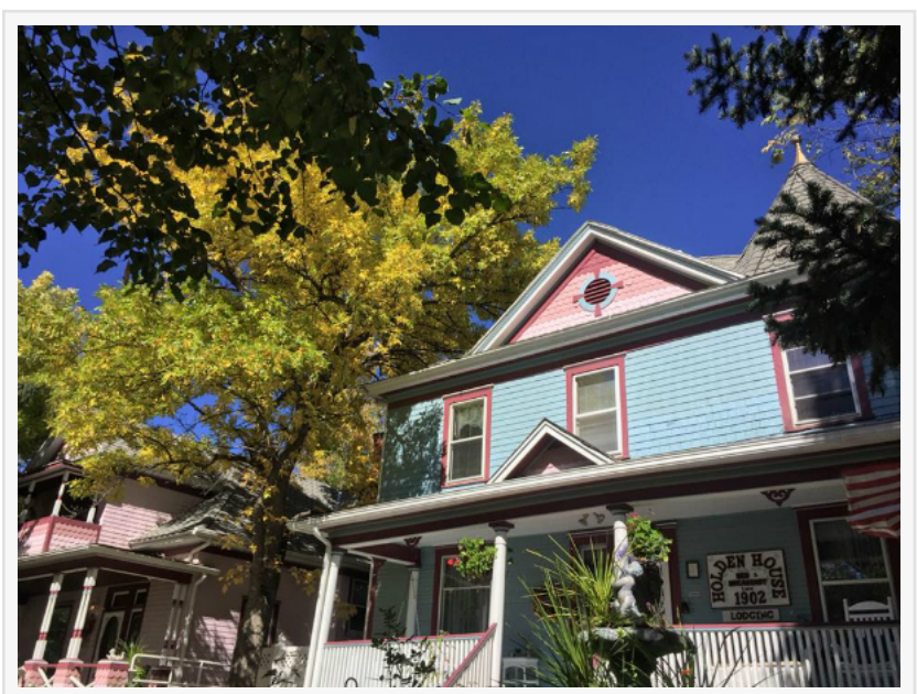
Fall is the perfect time to visit Holden House and the Pikes Peak region

COLORADO SPRINGS, COLORADO, UNITED STATES, September 22, 2019 /EINPresswire.com/ -- You've heard the phrase, "There's gold in them thar hills!" and there's no time like the fall season to enjoy gold in Colorado's high country while staying at a romantic bed and breakfast inn. Holden House 1902 Bed & Breakfast Inn, located in Colorado Springs is the perfect place to base your day excursions for aspen leaf peeping. The innkeepers at Holden House will point you to the best aspen gold colors, just a short drive to take a hike or windshield tour of the Pikes Peak region's beautiful and amazing scenery.