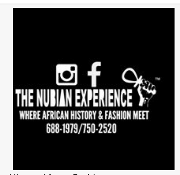
African History Meets Fashion