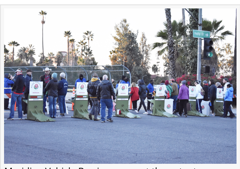
Meridian Vehicle Barriers support the entry to Tournament of Roses Parade grandstands

PASADENA, CA, UNITED STATES, September 24, 2019 / EINPresswire.com/ -- The City of Pasadena passed a measure to replace cones, a-frames and water barriers with certified hostile vehicle mitigation barriers designed and manufactured by <u>MERIDIAN</u><sup>®</sup> Rapid Defense Group. The resolution will expand coverage of MERIDIAN<sup>®</sup> barriers utilized this year at media corner to the entire parade route. Beginning at the 2020 Tournament of Roses Parade, the City Council approved deal will extend coverage for up to four additional years and include the deployment of more than 350 barriers.