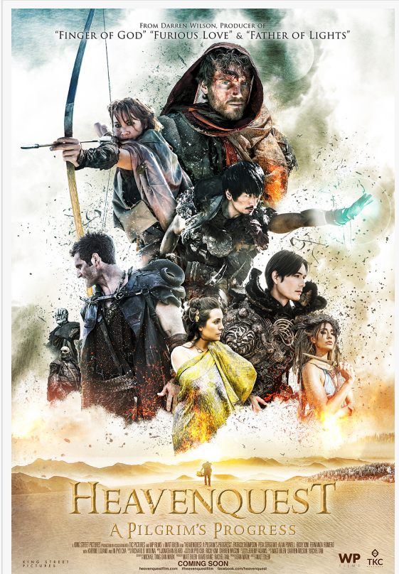
Heavenquest Key Art