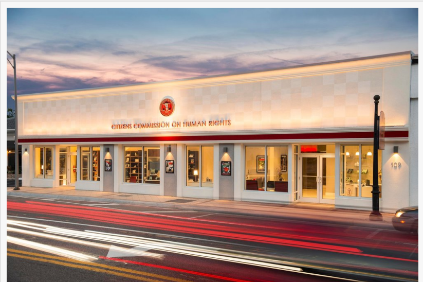
The headquarters for CCHR Florida are located in downtown Clearwater.

About CCHR: Initially established by the Church of Scientology and renowned psychiatrist Dr. Thomas Szasz in 1969, CCHR’s mission is to eradicate abuses committed under the guise of mental health and enact patient and consumer protections. L. Ron Hubbard, founder of Scientology, first brought psychiatric imprisonment to wide public notice: “Thousands and