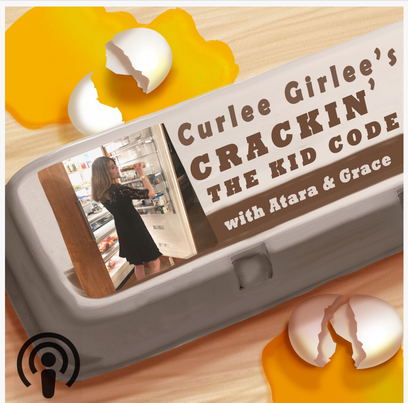
Parenting takes center stage on Curlee Girlee's Crackin' the Kid Code Podcast