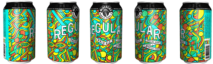
One of WISEACRE's newest year-round beers is Regular Pale Ale (5.1% ABV)

In addition to the Georgia launch, WISEACRE is also thrilled to announce the introduction of three new year-round beers : a pale ale, a Berliner weisse and an India Pale Ale series. Regular