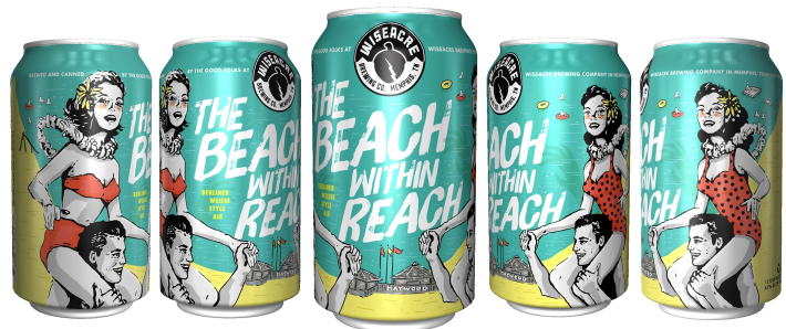
WISEACRE's new year-round beer Beach Within Reach is a Berliner Weisse.