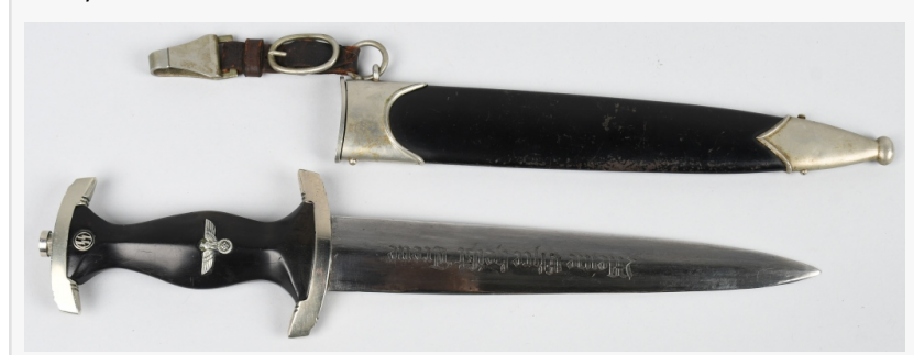
World War II Nazi SS M33 dedication dagger, circa 1933-37, approx. 22cm double-edged blade; plus scabbard. Etched with German phrase meaning 'My Honor Is Loyalty.' Estimate: $7,000-$9,000