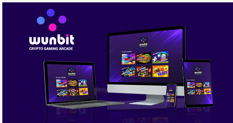
Wunbit will have many video games that run on smart contracts, thus making the platform safe and fair for players.