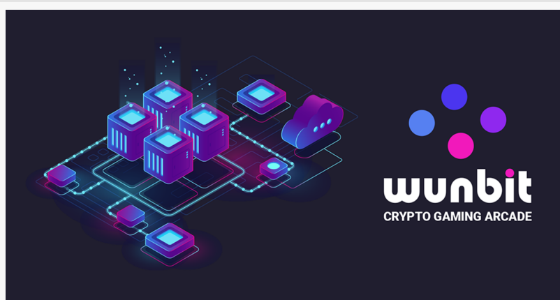
Wunbit - Crypto Gaming Arcade

The platform leverages secure APIs to connect games to the blockchain with smart contracts, allowing communication with the user's wallet in a secure and transparent way. Through the