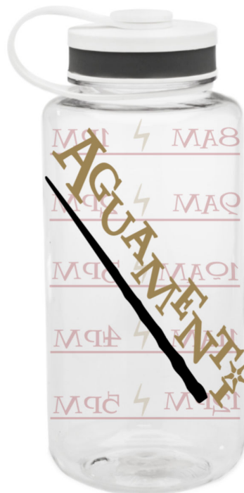
Aguamenti Water Bottle with Time Tracker