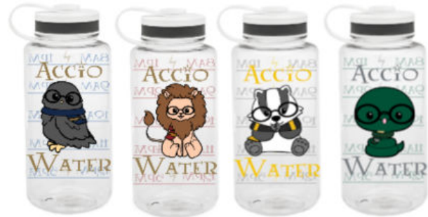
The Magical Paws Collection

Many designs are offered with customizable options, including font color choices, so each customer can craft their own motivational bottle.